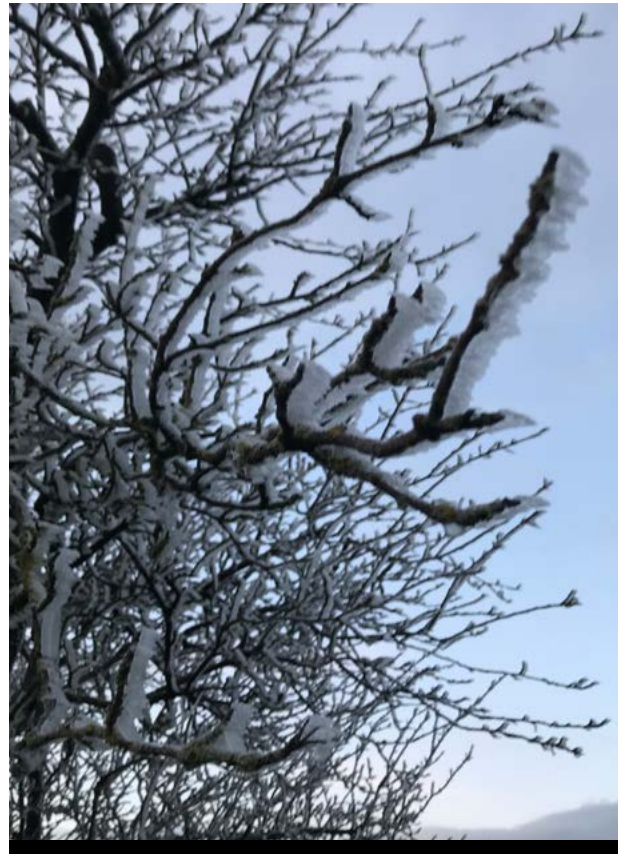
Surprise surprise a wind in Lacey green, but this amazing frost was blown on one side of the trees