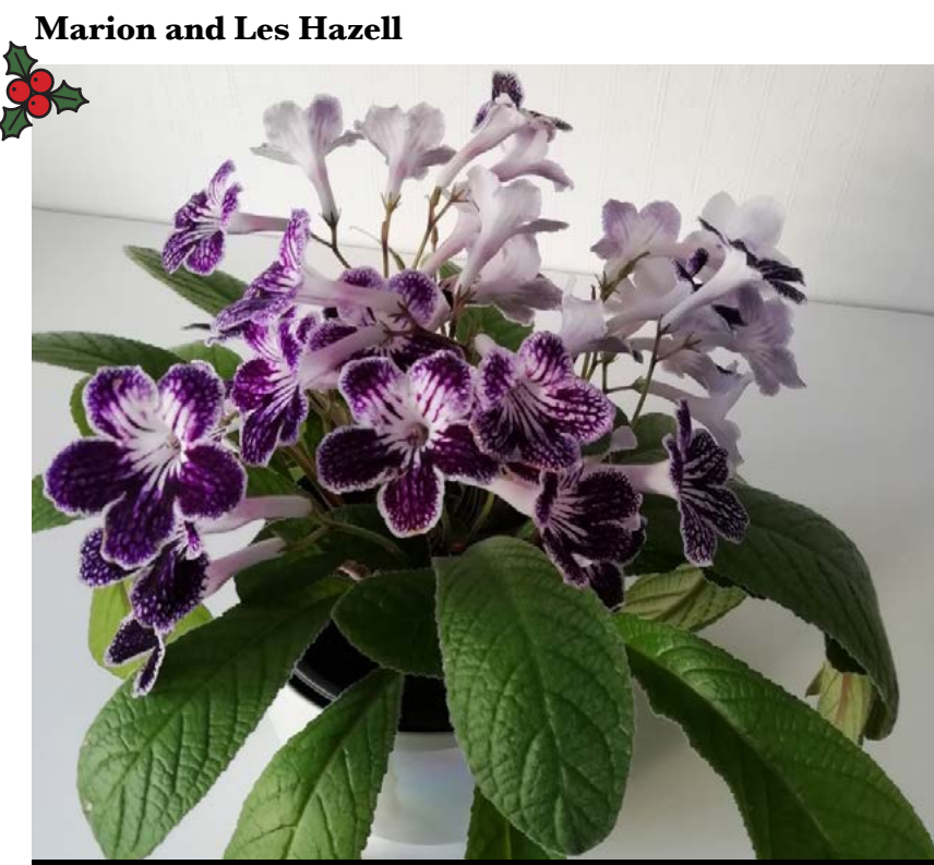
Streptocarcus still doing well - Polka Dot

The Horts committee would like to wish you all a Merry Christmas and a Happy New Year. Stay safe and keep well and we are looking forward to seeing you in 2021. Please keep your photographs coming over the Christmas break, send them to horticultural.society@btconnect.com Happy gardening!!!