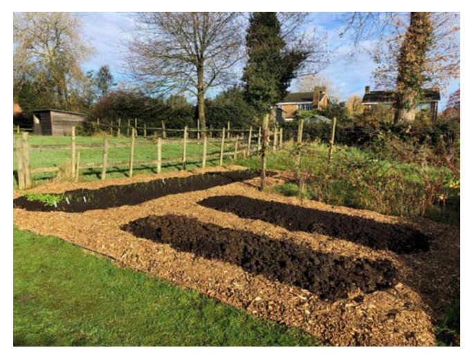
First week of December free woodchips arrived to go on top of the cardboard path area. No shovelling, or back breaking work, and you can plant in it straight away.