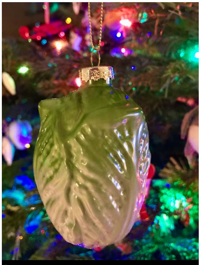
Received an early Christmas present, a Cos lettuce Christmas tree decoration