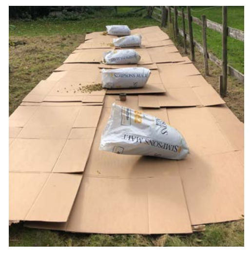
After strimming I laid a double layer of cardboard on top of that I tipped a thin layer of hops.