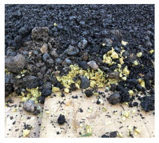
On top of the hops, horse manure, homemade compost and a little mushroom compost were spread.