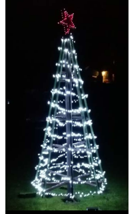
Christmas tree that Les made for the front garden