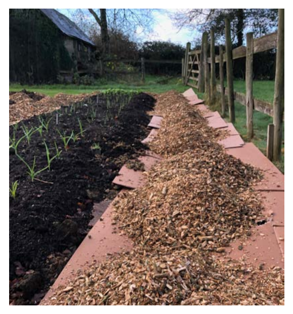
The beauty of No Dig is as soon as you've finished spreading compost you can plant straight away (These garlic and onions only took a week to get going)